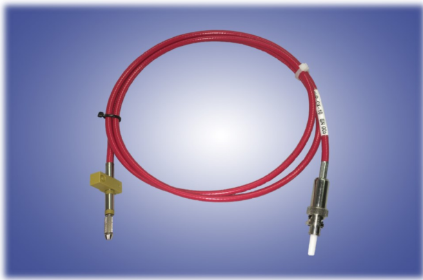
Figure 1 HVP-CX-10 probe holder for 10kV coaxial measurements

Probe holder for high voltage applications. The HVP-CX-10 comes with a 10kV UHV connector and coaxial cable for up to 10kV operation. A needle vise at the tip of the holder holds needle securely by an easy twisting operation.