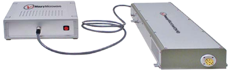
MT7553M12 with Controller

SERIES NOISE RECEIVER MODULES AND NOISE SWITCHING MODULES