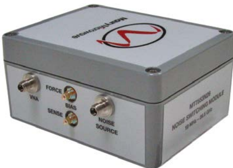
MT7553N26 Noise Switching Module.