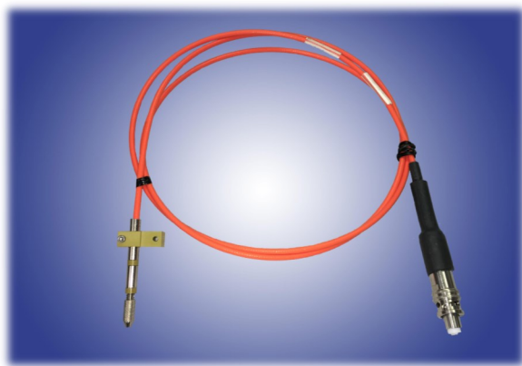
Figure 1 HVP-TX-3 probe holder for 3kV triaxial measurements

Probe holder for high voltage applications. The HVP-TX-3 comes with a HV triax connector and triaxial cable for up to 3kV operation. A needle vise at the tip of the holder holds needle securely by an easy twisting operation.