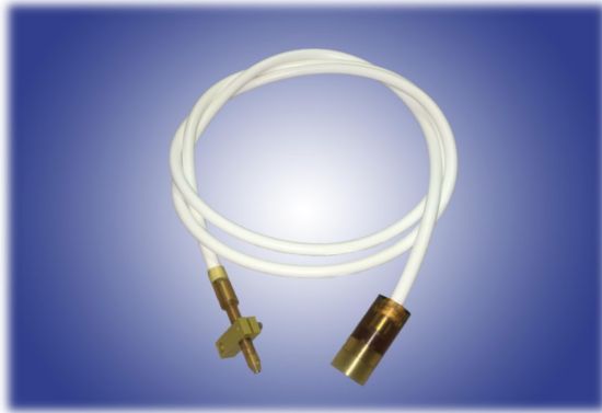
Figure 1 HVP-UX-20 probe holder for 20kV operation

Probe holder for ultra high voltage applications up to 20kV. The HVP-UX-20 comes with a UHV banana connector and flexible UHV cable for up to 20kV operation. A dielectric-encased holder holds needle securely with a screw-lock mechanism.